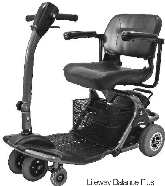
Liteway Balance Plus