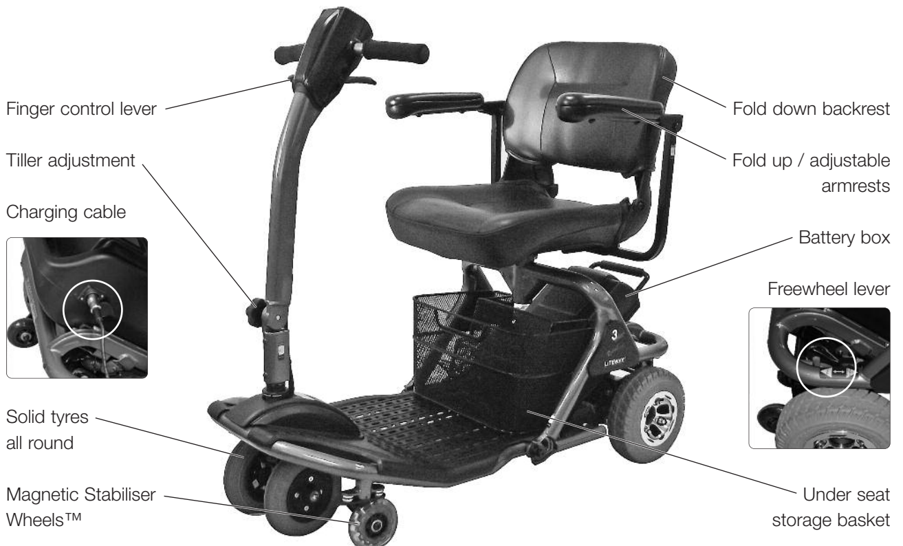
Photo shows Liteway Balance Plus model scooter. The Liteway Balance is a fixed-frame version. See the specification for the description of any differences.